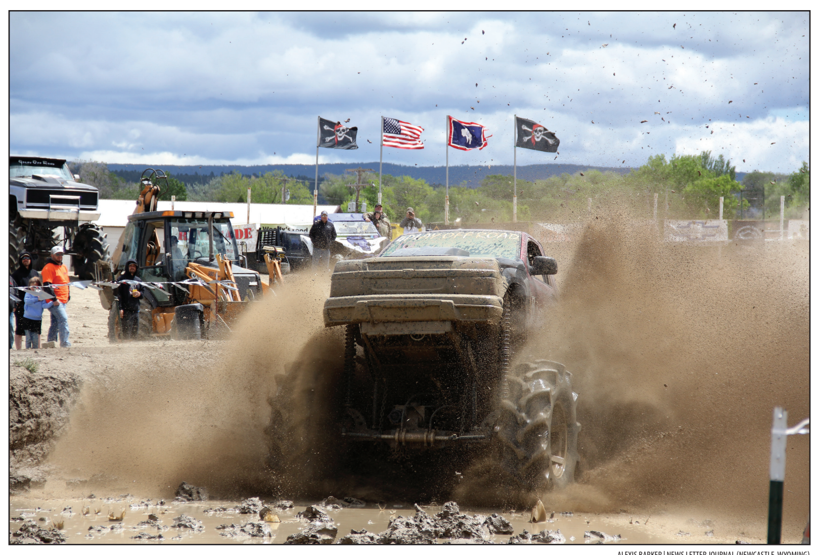
ALEXIS BARKER | NEWS LETTER JOURNAL (NEWCASTLE, WYOMING)