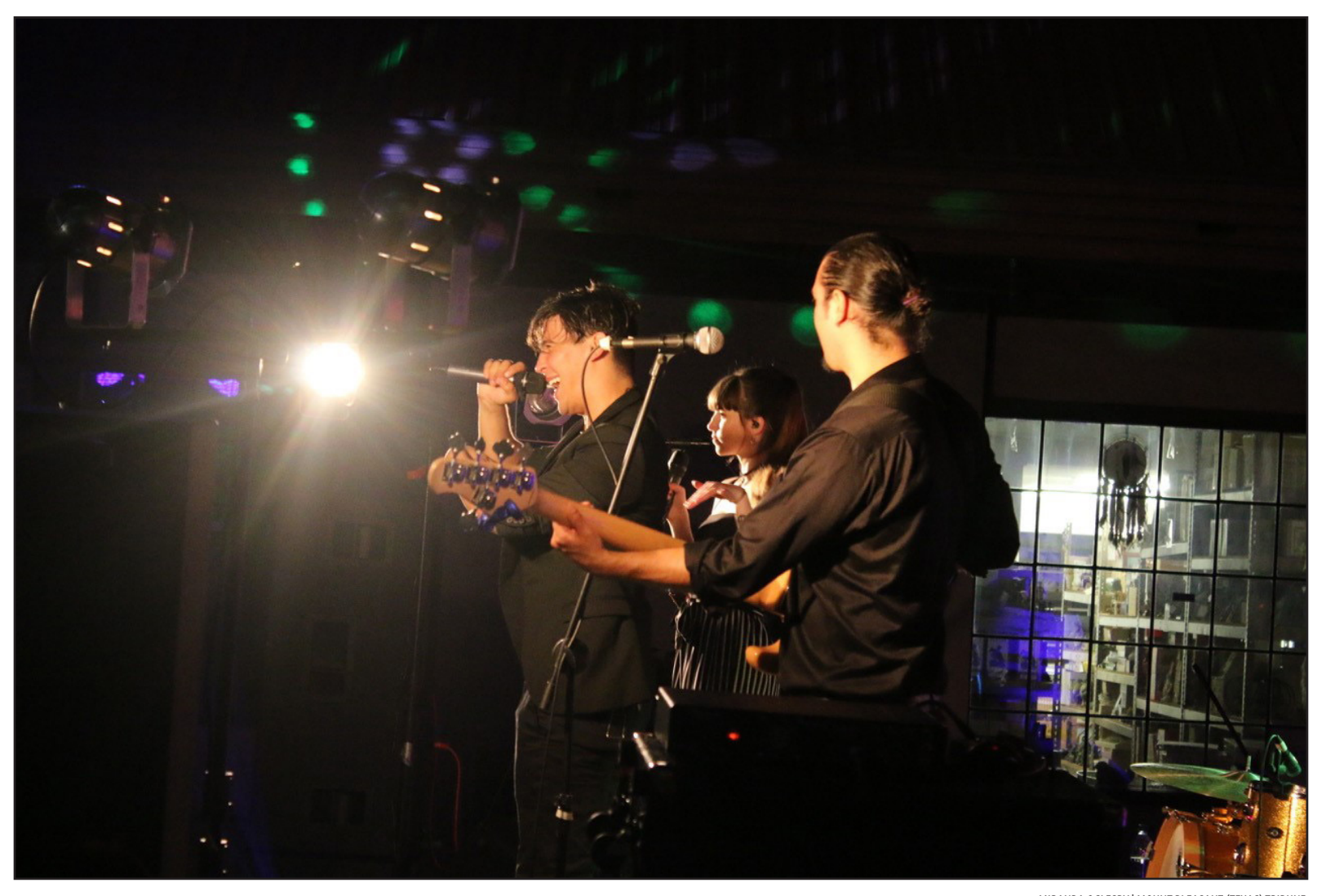
MIRANDA OGLESBY | MOUNT PLEASANT (TEXAS) TRIBUNE