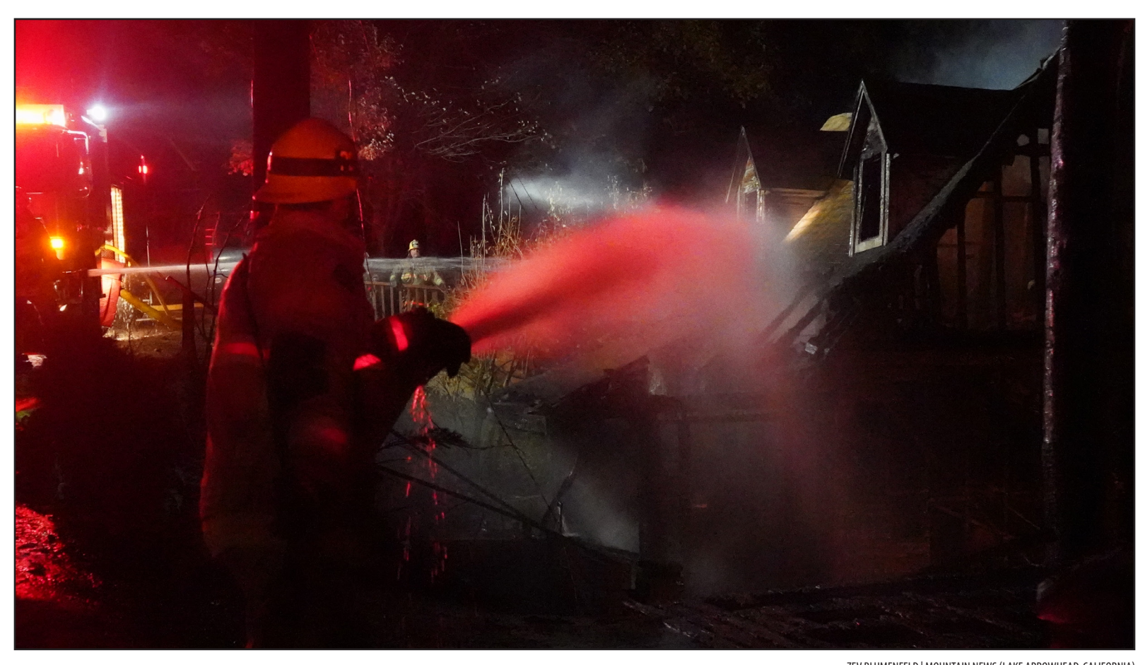
ZEV BLUMENFELD | MOUNTAIN NEWS (LAKE ARROWHEAD, CALIFORNIA)