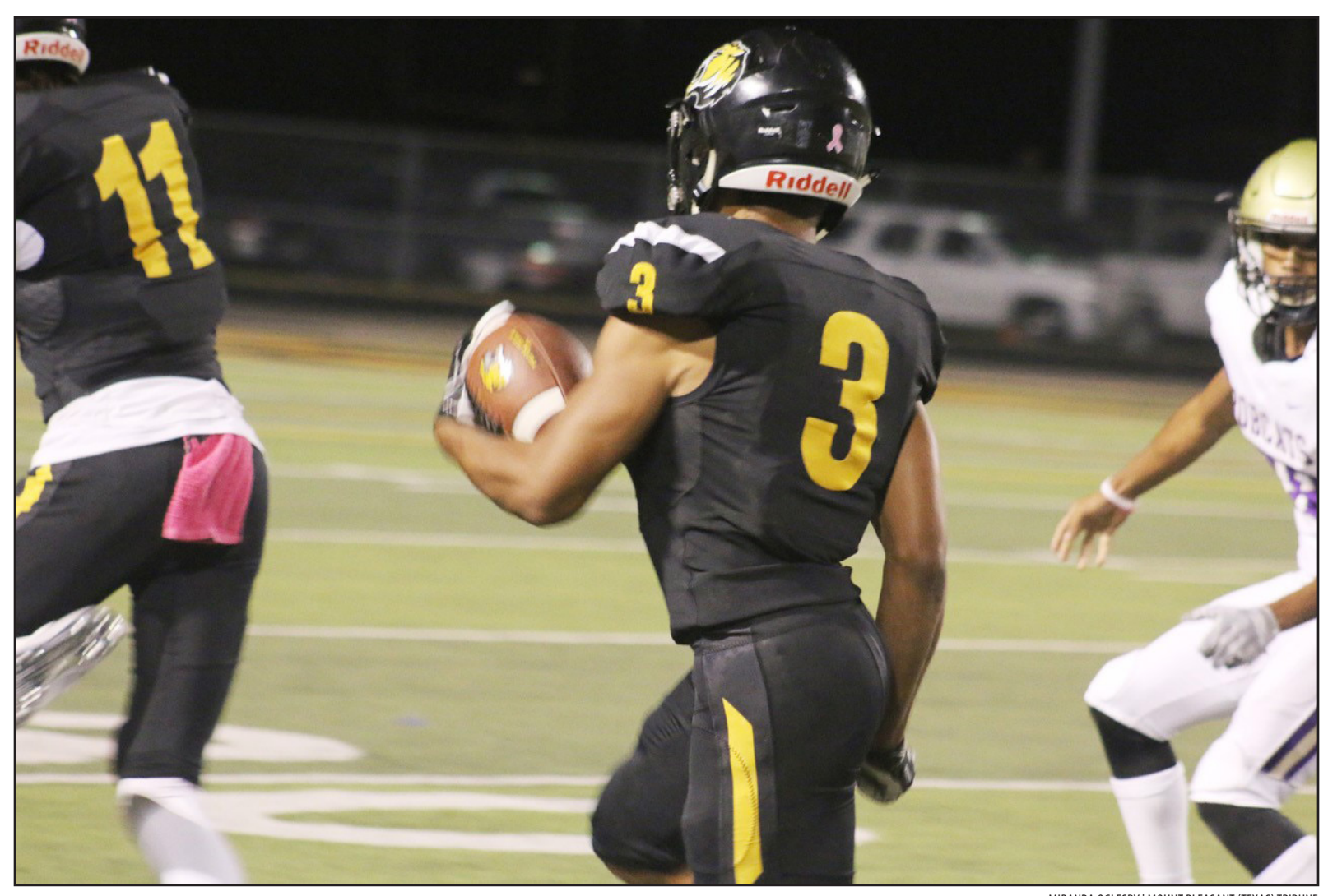
MIRANDA OGLESBY | MOUNT PLEASANT (TEXAS) TRIBUNE