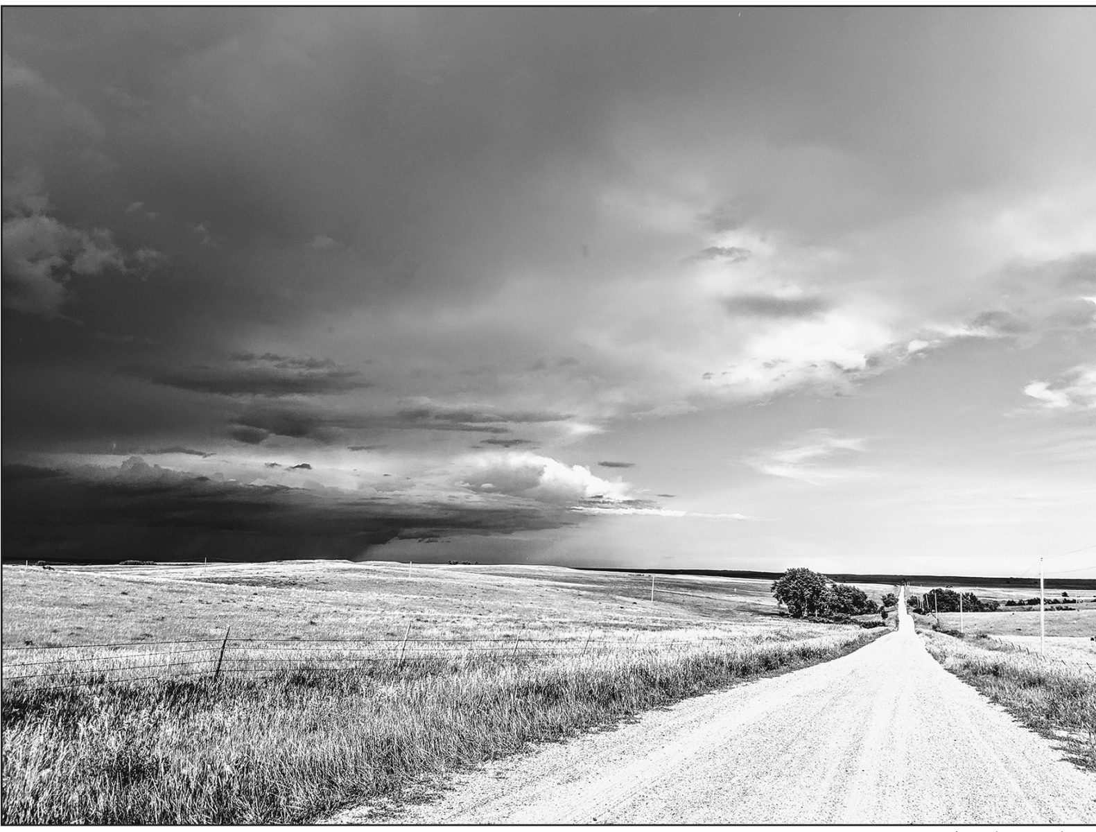
12 A STORM BUILDS north of White River on Sunday, June 21.

With cooler weather slowly setting in, SUNSETS OVER BUFFALO LAKE are hinting at the fall season with their rich, warm colors. Nights on the lake are becoming quieter as locals prepare to bid summer farewell and head into the next season.