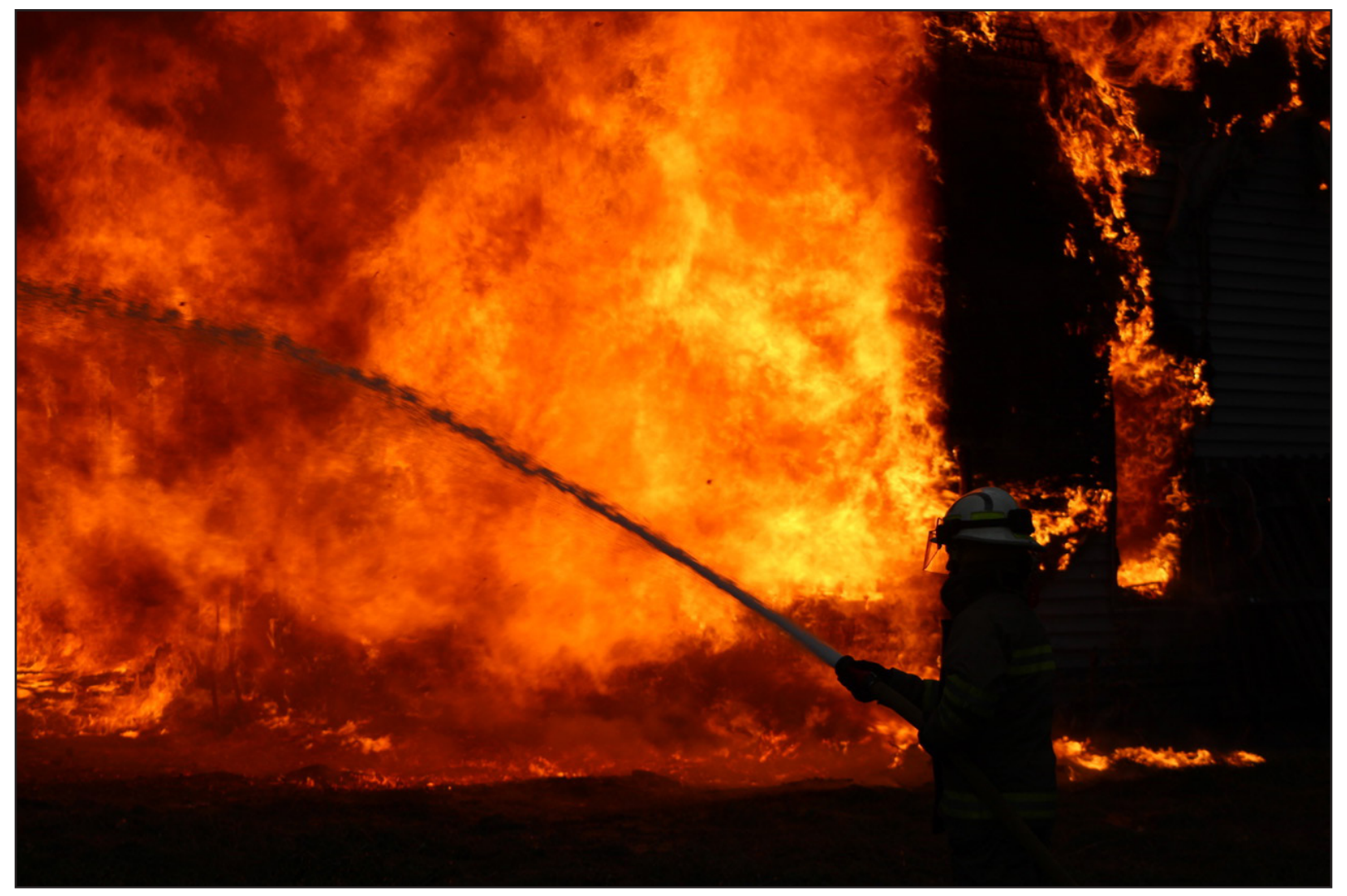
LUANN SCHINDLER | SUMMERLAND ADVOCATE-MESSENGER (CLEARWATER, NEBRASKA)

PLAYING WITH FIRE — A Clearwater volunteer fireman sprays a steady stream of water on a structure fire during a controlled burn exercise, on the southwestern edge of town, Oct. 2.