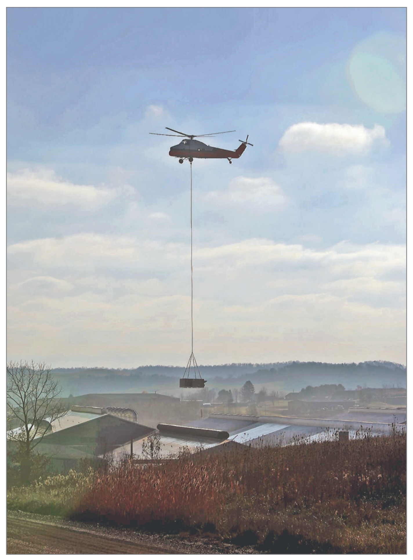
BEVERLY KELLER | THE BUDGET (SUGARCREEK, OHIO)

A few quick trips for this helicopter from the landing pad to a destination at Belden Brick's Plant 8 led to the installation of a pair of new air handling units by Alpine Heating. (March 17, 2021)